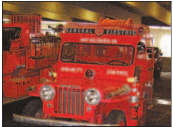
This Jeep also drew a lot of admirers.