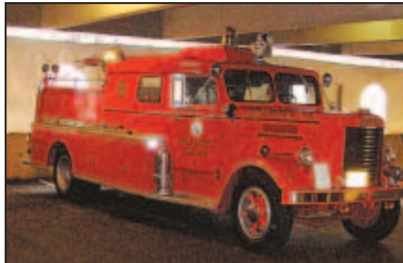
A very nice 1952 Oren Rescue Squad.