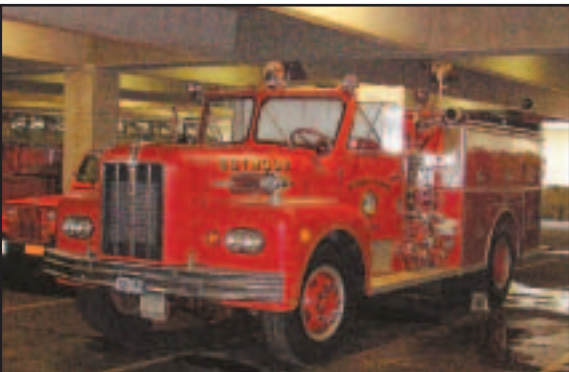
A Maxim pumper.