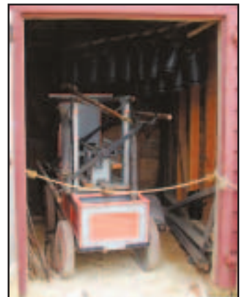
Colonial Williamsburg's reproduction of pumper used in the village in 1756.