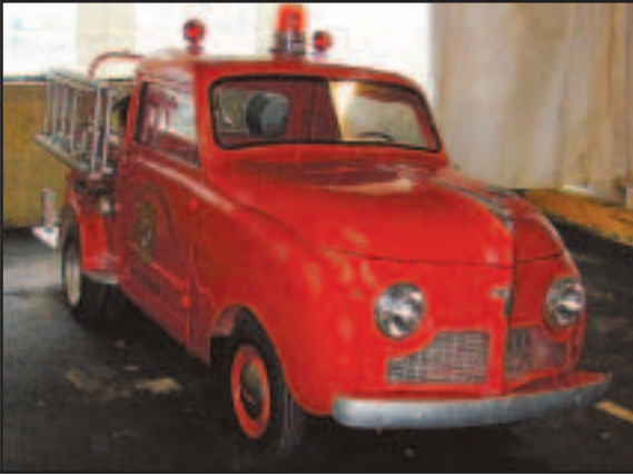
Though not a "true" fire truck this old Crosley drew attention all day.