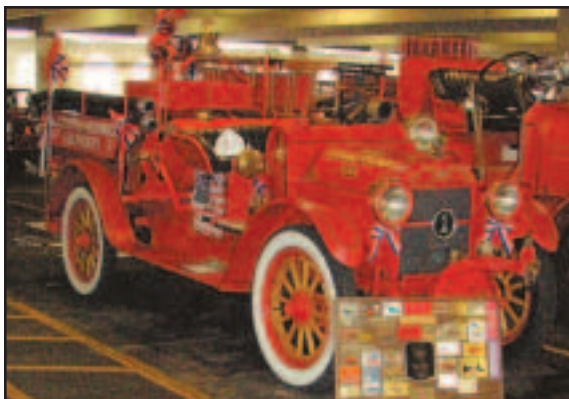
Old Dominion's 1921 REO

In northern Kentucky near Cincinnati, (home of Hagy) trees and bushes were covered by ice, but the roads had been cleared. There was about 150 miles of ice covered trees and signs in Kentucky, at times it was like driving through an ice tunnel.