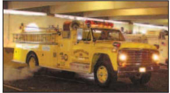
This Ford left early in the muster, due to weather coming in. Nice rig though!