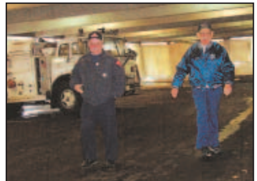
I think this is called "trouble on the hoof"!